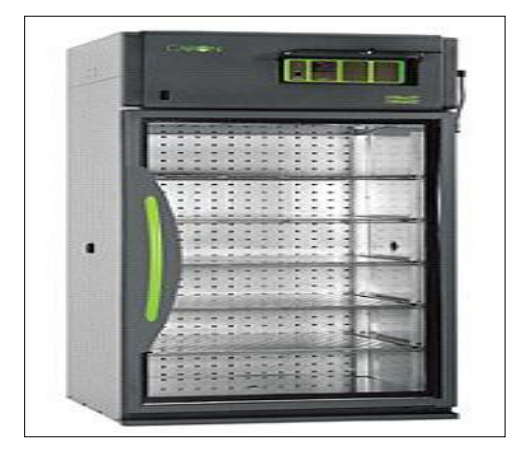
Figure 2: Estimation of shelf life and expiry date